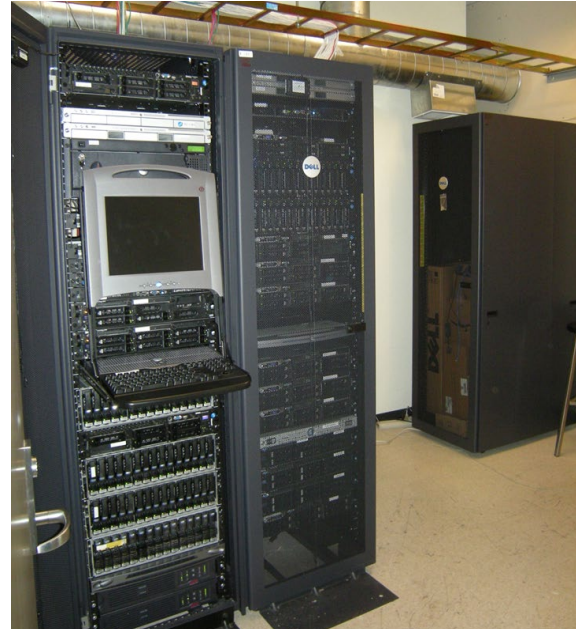
Above- The single fan coil does not meet the cooling load of this server closet. Cooling is supplemented by the building HVAC system, requiring it to run all the time. This inefficiency results in a PUE of 2.14.

Although significant, prior to the study, the energy costs of running these server rooms were unknown. This study highlights the high cost of running distributed server rooms, and hopefully provides the evidence and motivation necessary for Stanford departments to choose the most efficient option for their servers.