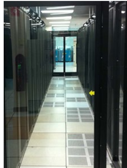
Above- A contained hot aisle of the high-density computing room prevents hot air from mixing with cool air, reducing the energy needed to air condition the room. This efficiency results in a PUE of 1.27.